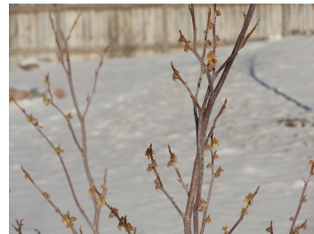
Witchhazel in the snow

Our dreams for meaningful Jewish lives in Montana are like this little tree: durable, hardy in inhospitable climes, impossibly and unexpectedly beautiful. Somehow, despite our small numbers and distance from established Jewish infrastructure, we are finding our way here, building a community that treasures its children and transmits the fundamental values of Judaism in a loving, inclusive way. When I wake every morning, I give thanks for our intertwined lives, for the hope and support we give each other, and for the adventures of spirit we share. Har Shalom is becoming a place where we can dream and grow together.